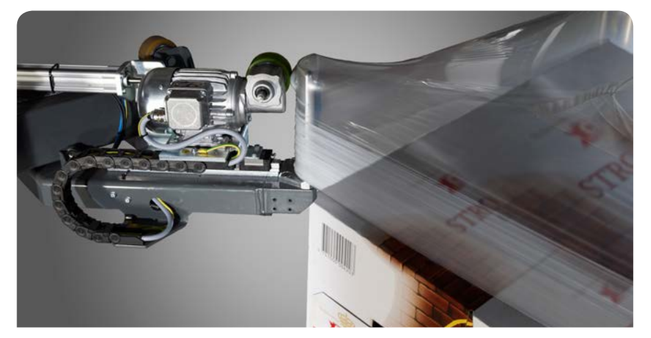
With our sharp corner patent, US 7,040,706 B2, we eliminate thin and fragile film on the corners of the load, keeping the film approx. 30% thicker than without using the system.

Simplicity, sustainability and innovation have been the leading principles in the development of the Multi Fle X1 stretch hood wrapping machine.